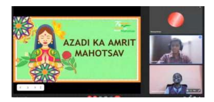
Students are enraptured on the country-wide campaign Azadika Amrit Mahotsav , a truly patriotic notion!

Well - renowned DAV Alumni, sit together for a meet and greet with our school hosts to dish on how our institution induced patriotism in them to work for our nation!